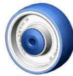
Polyurethane wheel or polyurethane ESD wheel